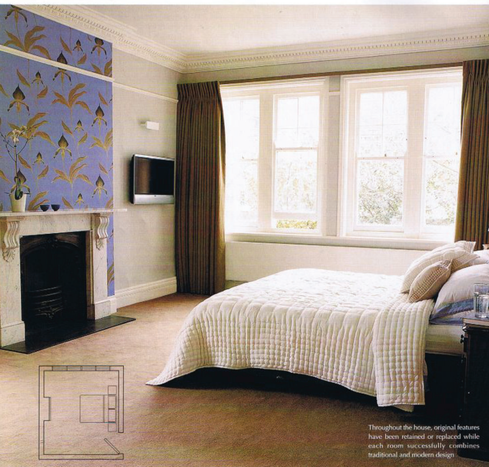
Throughout the house, original features have been retained or replaced while each room successfully combines traditional and modern design

Upstairs, in the master bedroom, Farrow & Ball's Cornforth White, a soft blue-grey colour, creates a restful backdrop for a traditional rosewood bed and bedside cabinets, while the wall-mounted LCD TV adds a contemporary touch to the scheme. On the chimney breast, the distinctive Orchid design wallpaper in vivid blue from Cole & Son provides, as Katie