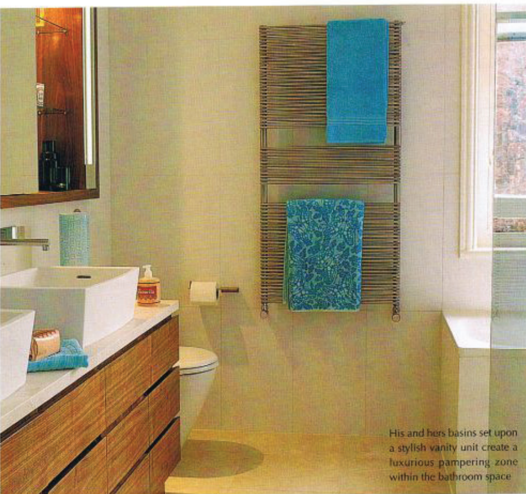
His and hers basins set upon a stylish vanity unit create a luxurious pampering zone within the bathroom space