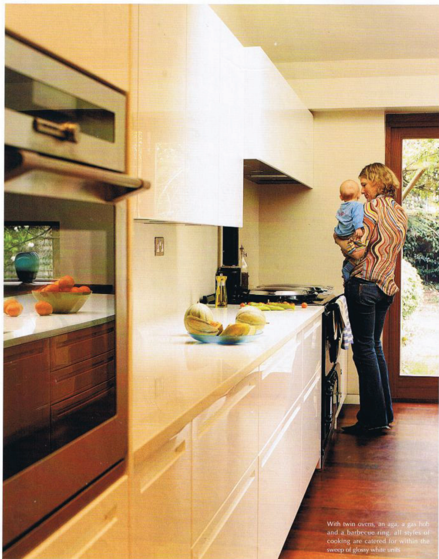
With twin ovens, an aga, a gas hob and a barbecue ring, all styles of cooking are catered for within the sweep of glossy white units