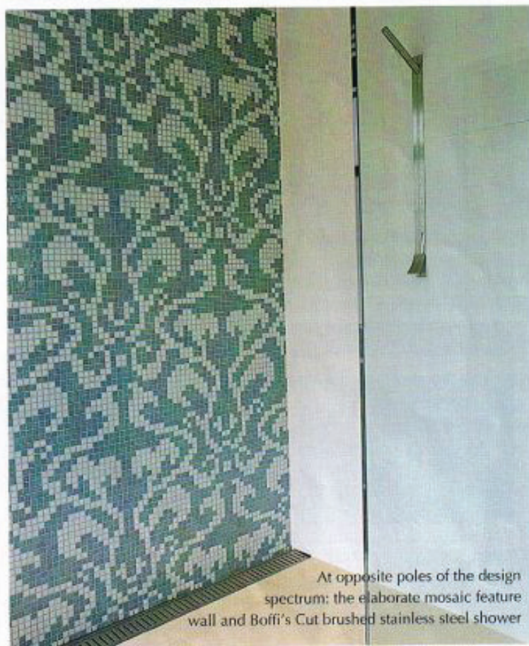
At opposite poles of the design spectrum: the elaborate mosaic feature wall and Boffi's Cut brushed stainless steel shower