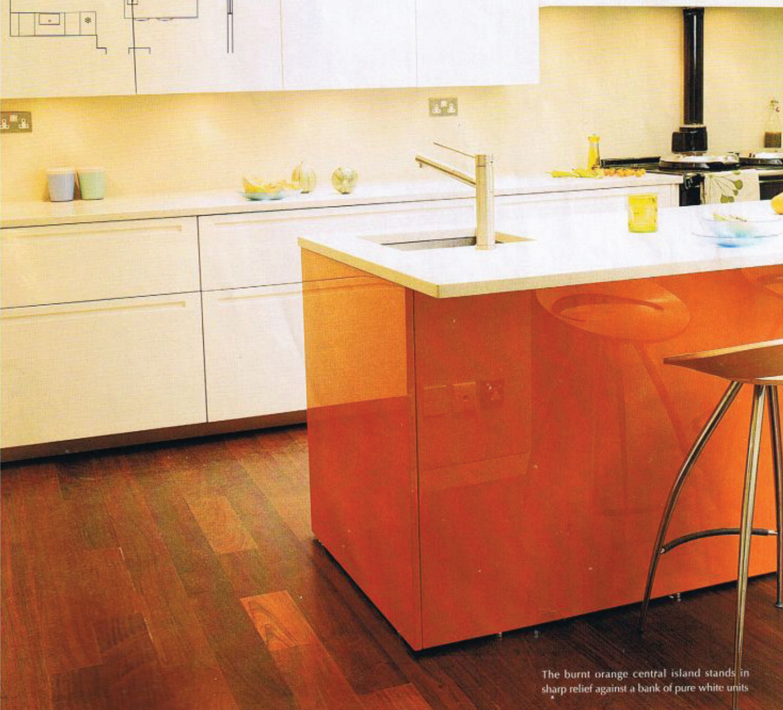
The burnt orange central island stands in sharp relief against a bank of pure white units