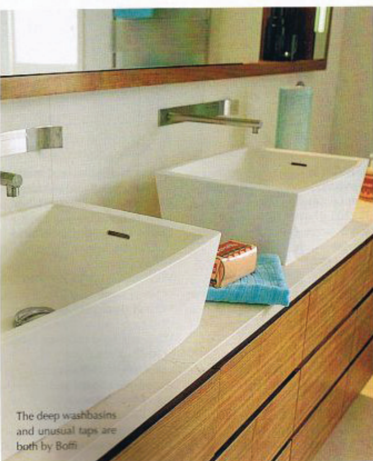
The deep washbasins and unusual taps are both by Boffi

"As long as they have prepared a wish list of their requirements then it's up to me to make it work. The size and shape of the space tends to dictate what can and cannot be done, but I try to find a way to make it all fit together, like a jigsaw."